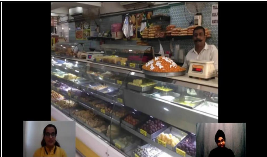
Snippets of the actual video. In frame, food on display in an outlet.