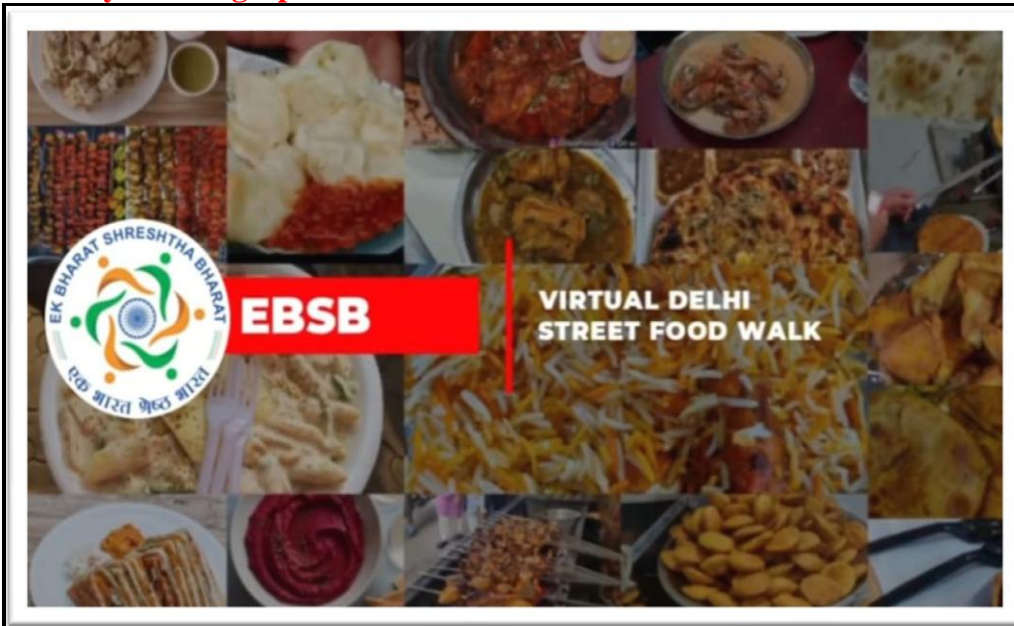
Last episode of Virtual Delhi Street Food Walk organised by IHM Pusa under Ek Bharat Shreshtha Bharat on 18th August, 2020.