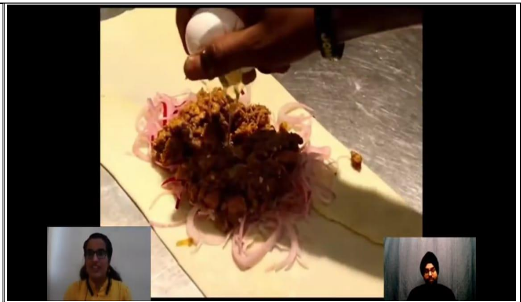
Snippets of the actual video. In frame, food prep from a famous outlet. In